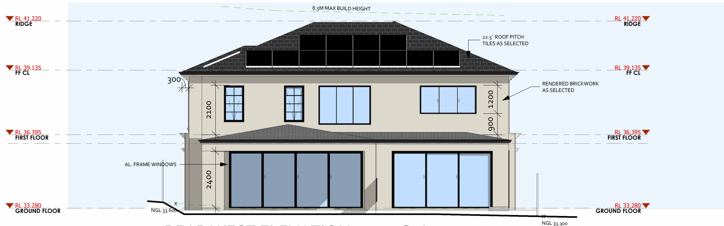
REAR WEST ELEVATION 1:100 @ A3