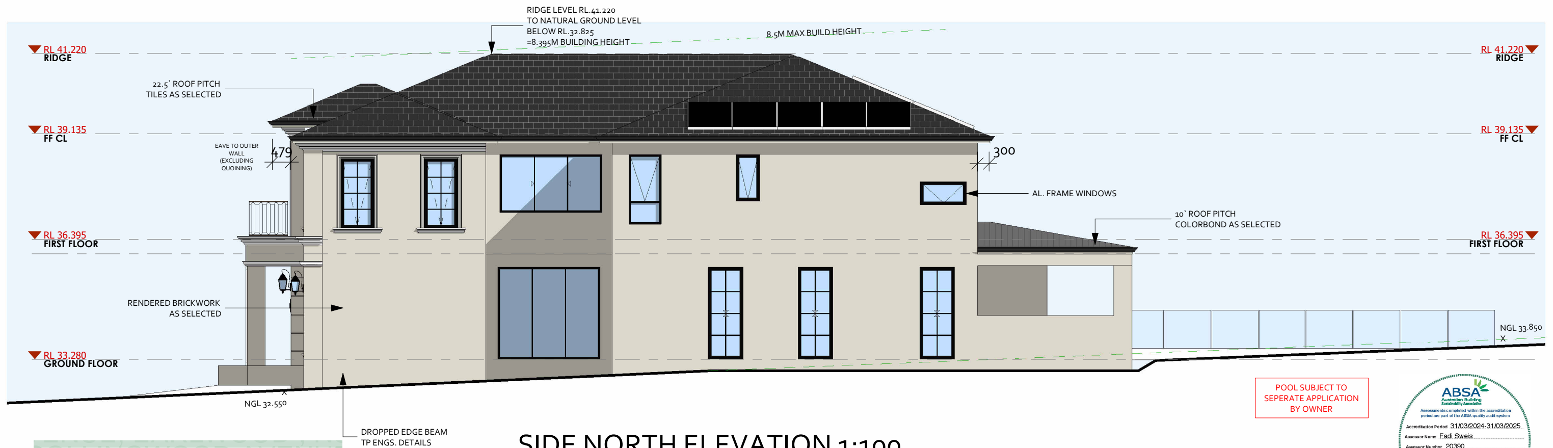
SIDE NORTH ELEVATION 1:100